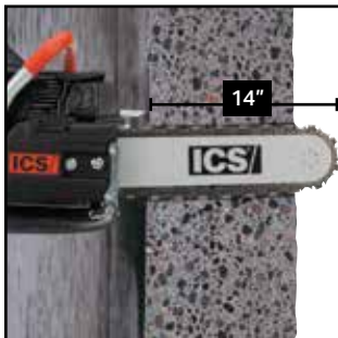
Deep cutting solution for obstructed or small openings

Extended drive sprocket adapter offers easy chain assembly