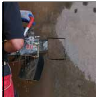
Cut squares as small as 4" x 4" (10 cm x 10 cm)