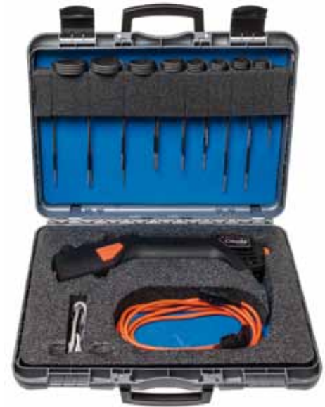
The iDuctor, the easily replaceable coils and the safety mains lead with patented IEC Lock connection are delivered in a protective plastic case.